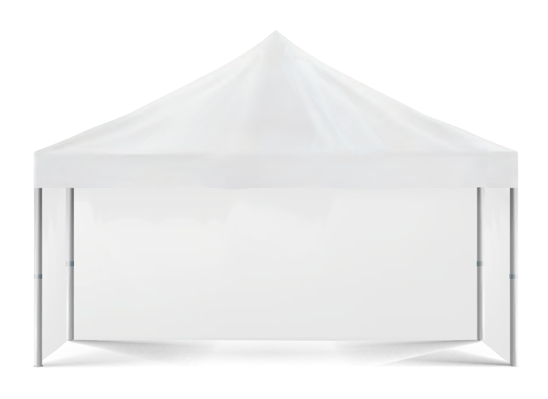
18 sqm (3m x 6m)