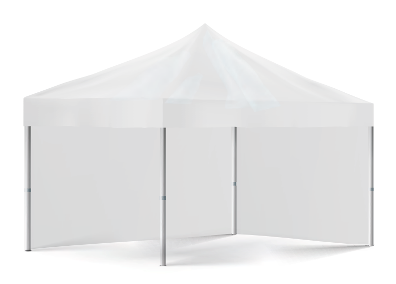
9 \text{ sqm } (3m \times 3m)